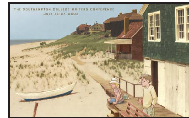
2003 Southampton College Writers Conference Poster - Garry Trudeau

"I thought it professional, scholarly and rewarding."