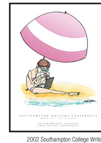
2002 Southampton College Writers Conference Poster - Jules Feiffer

"I went in not knowing what to expect and came out pleased, inspired, educated, enlightened and satisfied."